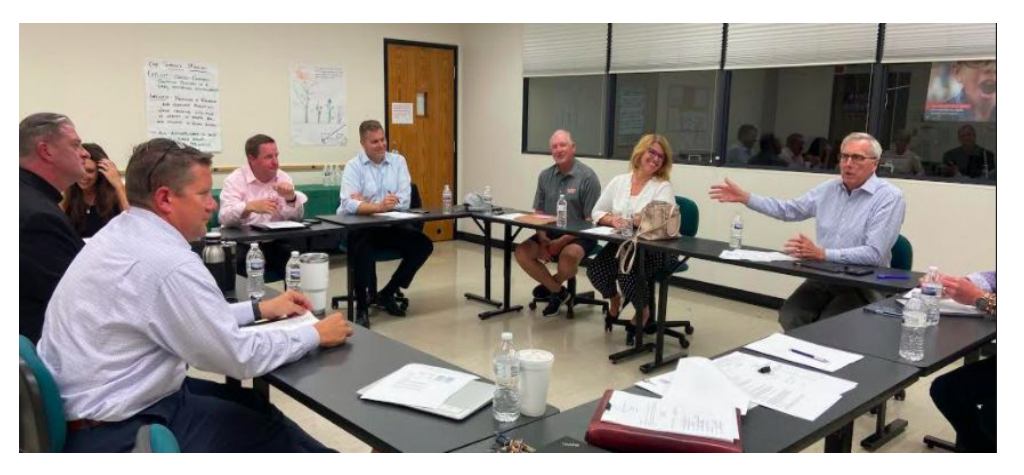
JCS Board of Trustees Meetings 24-25 All meetings are 4:00 - 5:30 p.m.

Wednesday, August 14 Wednesday, October 9 Wednesday, December 11